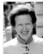
The President: HRH The Princess Royal 15 August